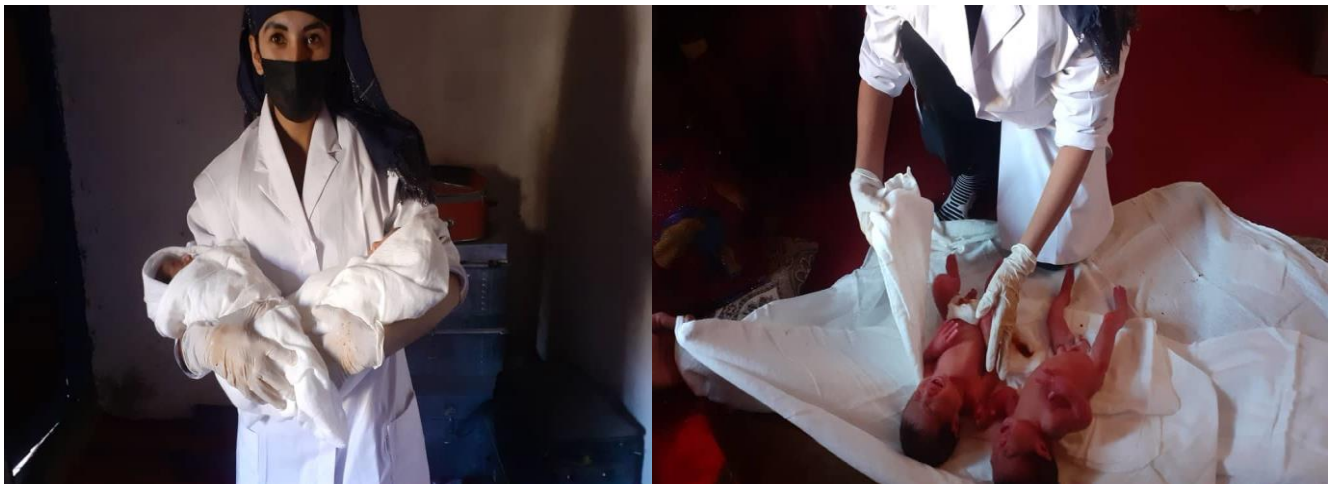
Figure 1: Figure 1 & 2: Normal Twin Delivery by Argo MHT-2 midwife.

The main achievements of the project were the establishment and set up of six provincial offices, recruitment of all project staff, establishing of 61 MHTs in the inception phase of the project, the project objective and scope of services were presented to project staff, relevant PHDs, DHOs and other stakeholders in the orientation sessions were held for these purposes. Totally 205,694.00 people including men, women, boys and girls benefited from the RMNCH and PSS Services provided by 61 MHTs in hard-to-reach areas of the six mentioned provinces. In addition, 46904 families benefited from the winterization kits. Moreover, 122 well-furnished connexes installed in 61 Service Deliveries Points (SDP). The project activities and services delivery were monitored and the required reports including MIAR, weekly, monthly, and quarterly work plan progress reports were submitted.