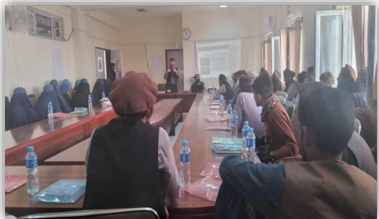
Figure 2: Training for staff

Kunar and Laghman provinces were trained on Wash, Health, Education, Nutrition, Child Protection, Community Engagement and Interpersonal communication for three days.