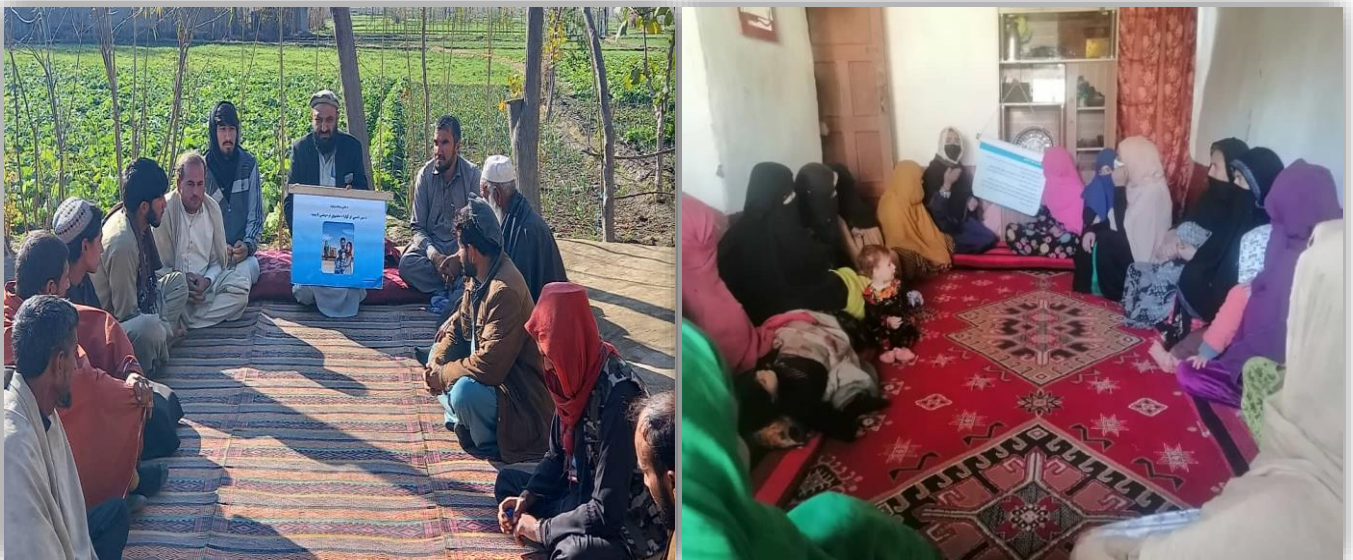
Figure 3: Community Engagement in Laghman